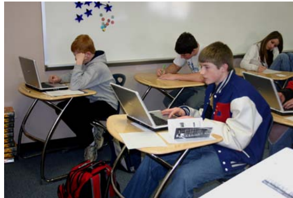
English students accessing the internet for research using wireless laptops.

Along with the usual array of course offerings, Hanover High School offers outstanding , well established vocational and fine arts electives. In addition to having national champions in FCCLA and FBLA, Hanover boasts a strong FFA, NHS, STUCO, and a Distinguished Service Program. Hanover has strong athletic programs which include high school and junior high offerings in volleyball, football, basketball, cheerleading, and track. Golf is also offered for high school students.