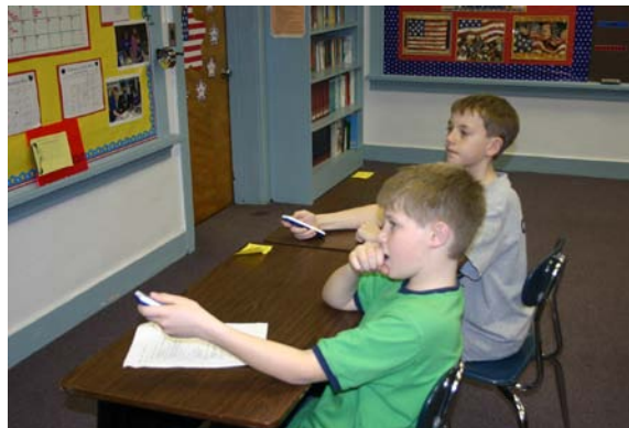
Teachers in Hanover are able to get immediate results and maximize every learning opportunity by using one of the student response systems available.

The entire campus at Hanover is equipped with wireless internet. This technology allows students in any of our classrooms to access the internet using laptops from one of our three mobile computer labs. These mobile labs compliment our two desktop computer labs and provide us with Distance Learning Network (DLN), allowing students to take dual-credit classes as well as provide alternative learning options for those who need them. Teachers utilize digital whiteboards and interactive student response systems.